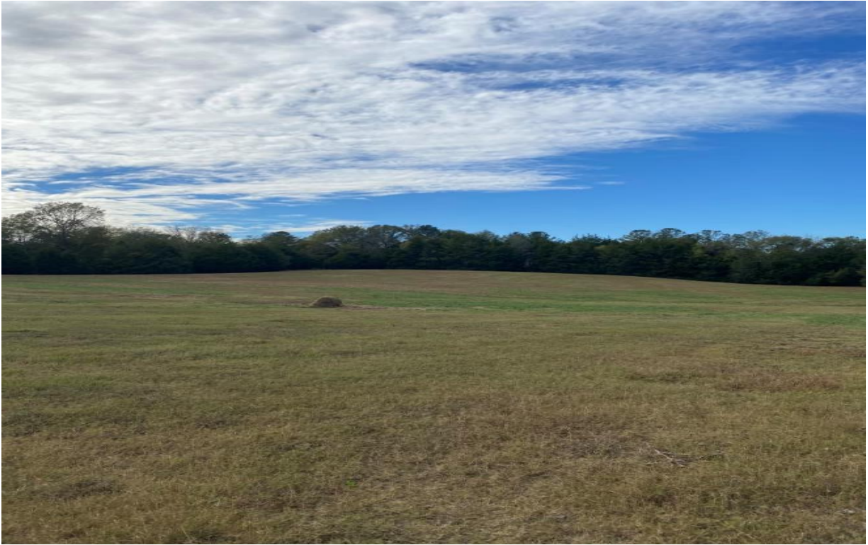
Lot 2 6.68 acres